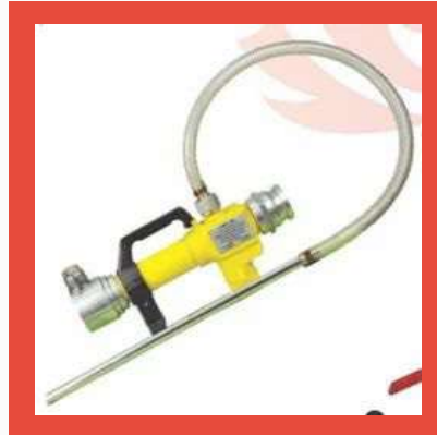
Inline Foam Inductor