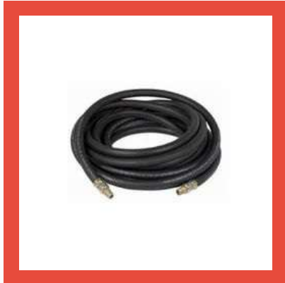
Rubber Hose Pipe