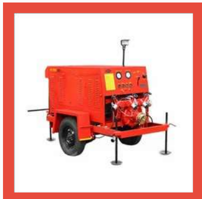
Trailer Fire Pump