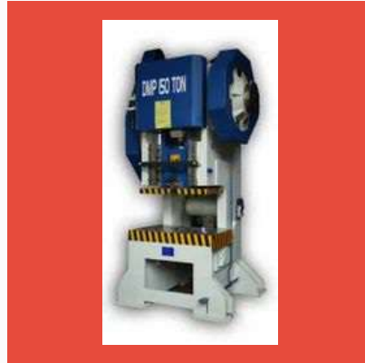
Mechanical Power Presses