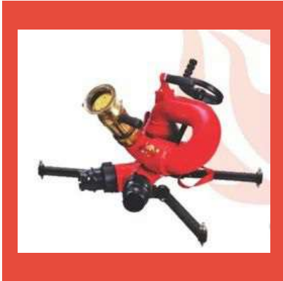
Water Monitors and Water Cum Foam Monitors