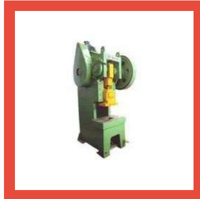
C Type Power Press