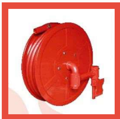
Swinging Type Hose Reel