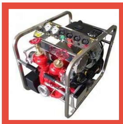
Portable Fire Pump