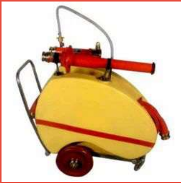
Mobile Foam Trolley