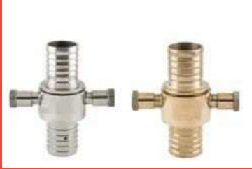
Stainless Steel Instantaneous Coupling