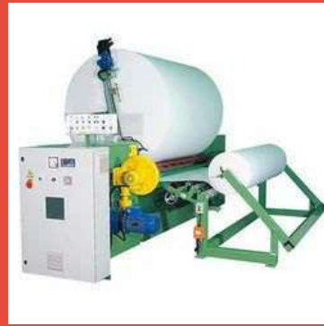
Foam Making Equipments