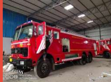
Fire Tender Vehicle Foam Tender Vehicle