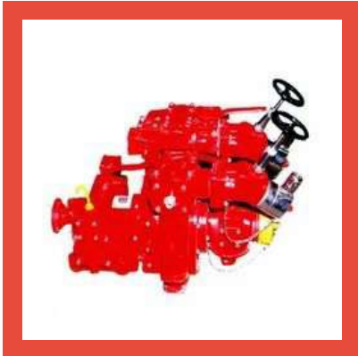
Multipurpose High Pressure Fire Pump