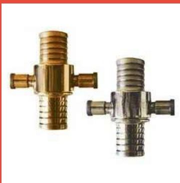
Suction Hose Couplings