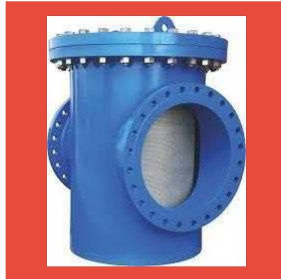
Basket Type Strainers