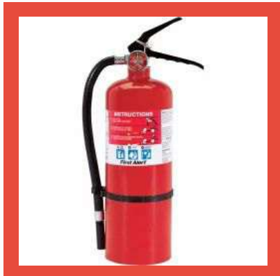
Portable Fire Extinguisher