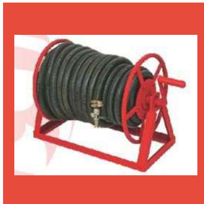
Stand Mounting Hose Reel