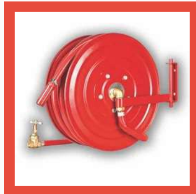
Fire Hose Reels