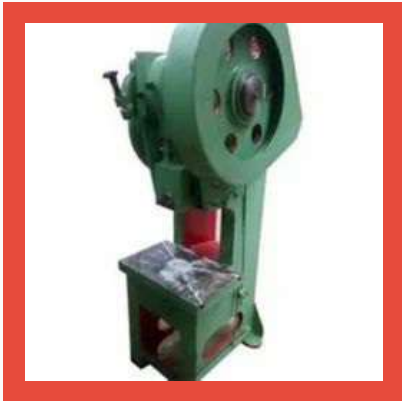
Single Action Power Press Machine