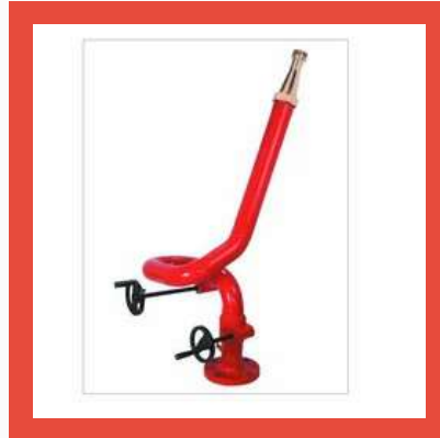
Water Cum Foam Monitor