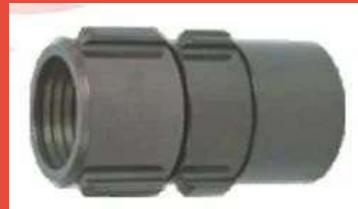
American Rocker Lug Couplings