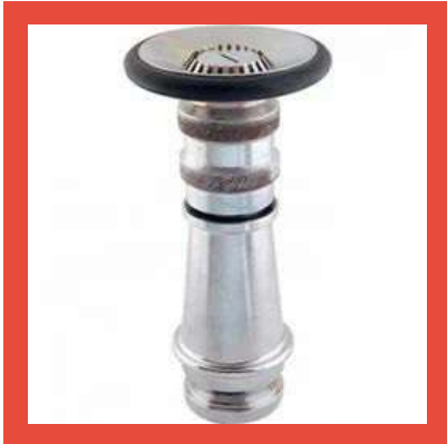
Universal Branch Pipe