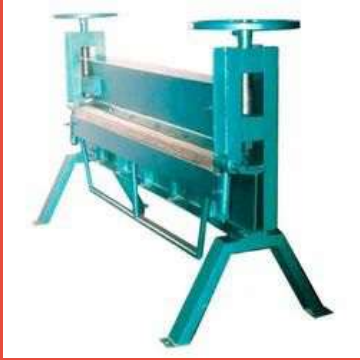
Metal Sheet Bending Machine