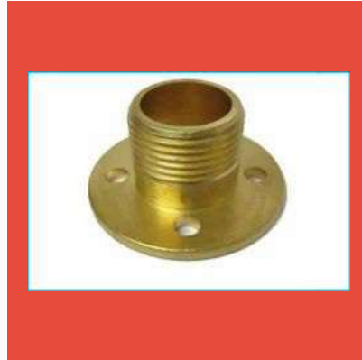
Brass Flange Adaptors