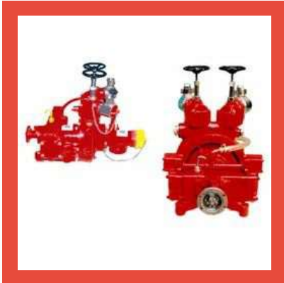
Single Stage Fire Pump