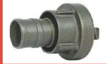
Storz Type Hose Coupling