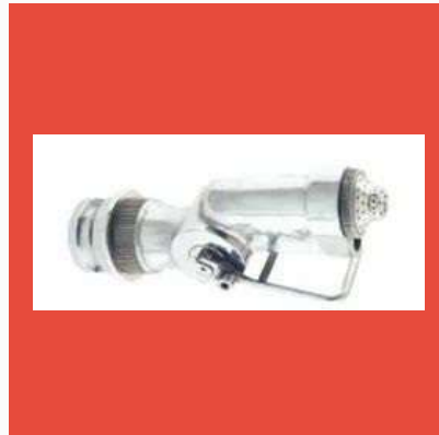
Mist Fog Nozzle