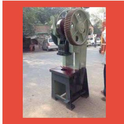
C Frame Pillar Type Power Press