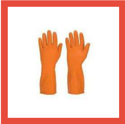
Safety Hand Gloves