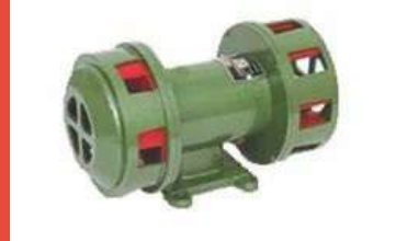
Industrial Electric Siren