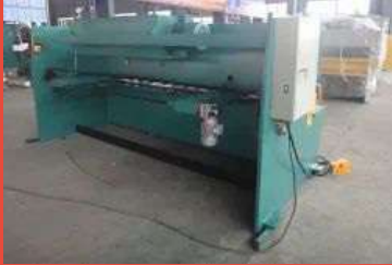
Sheet Cutting Shearing Machines