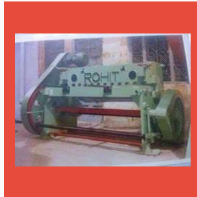
Sheet Cutting Shearing Machine