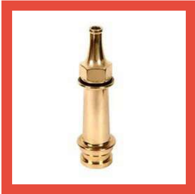
London Pattern Hand Control Branch