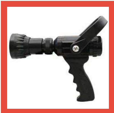
Constant Flow Nozzle