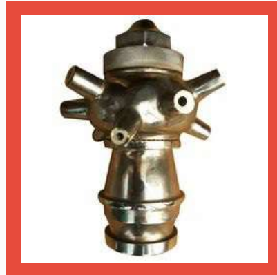
Revolving Branch Pipe