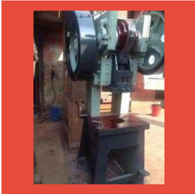
H Frame Pillar Type Power Press