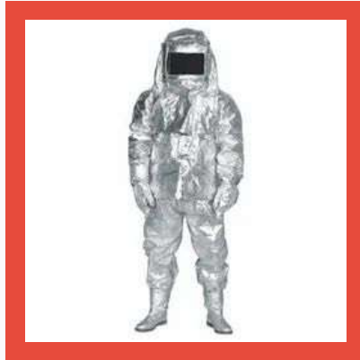
Fire Safety Suit