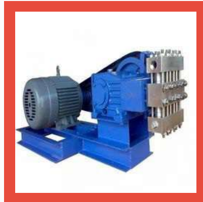
Ultra High Pressure Pump