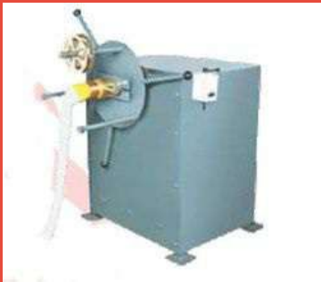
Electric Hose Binding Machine