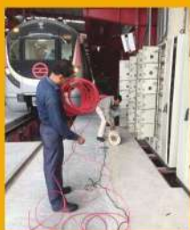
Live Project Installtion Pics