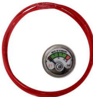
Fire Detection Tube & FT Pressure Gauge