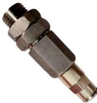
End of Line Adaptor