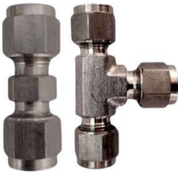
SS Union & Tee