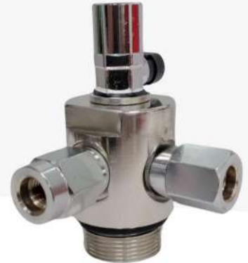
DLP Valve Double NRV