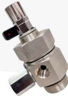
ILP valve for Kitchen suppression system