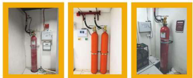
Live Project Installtion Pics