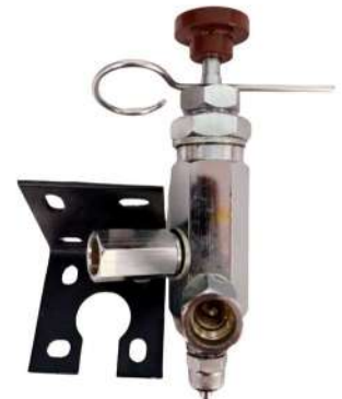
Manual Release Double NRV