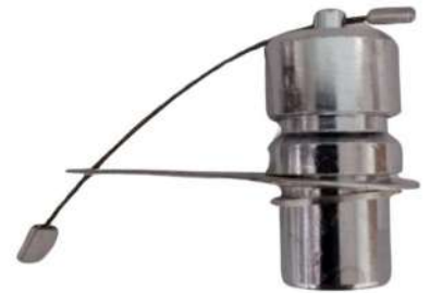
SS Nozzel for Kitchen Suppression system