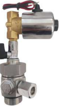
ILP valve with Solenoid Valve